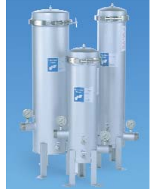
22 round Premium Series