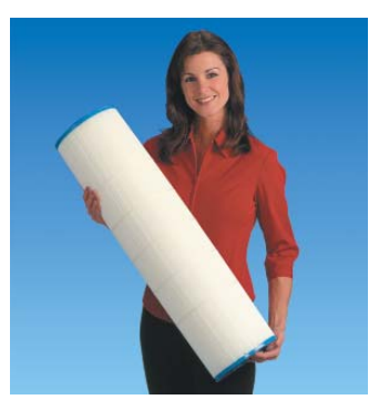
Flow-Max jumbo cartridge

Flow-Max pleated cartridges cost less to use, regardless what they cost to buy!