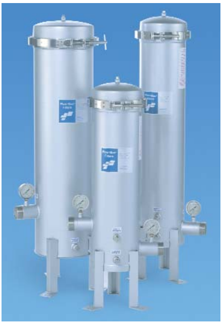
Legs and pressure gauges are standard.