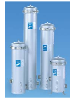
4 & 5 round models