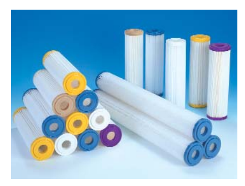
Flow-Max pleated cartridges

We offer a wide range of filter housings, which accept standard 2-3/4" OD cartridges, or one single "jumbo" cartridge to provide optimum convenience.